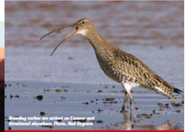
Breeding curlew are extinct on Exmoor and threatened elsewhere.