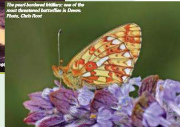
The pearl-bordered fritillary: one of the most threatened butterflies in Devon.