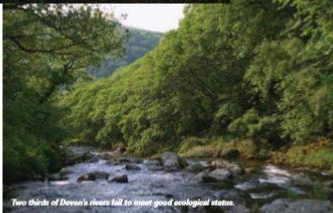
Two thirds of Devon's rivers fail to meet good ecological status.