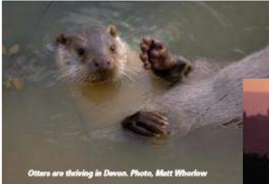
Otters are thriving in Devon.