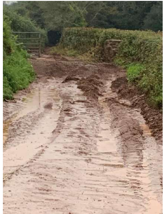
Mud on screw lane