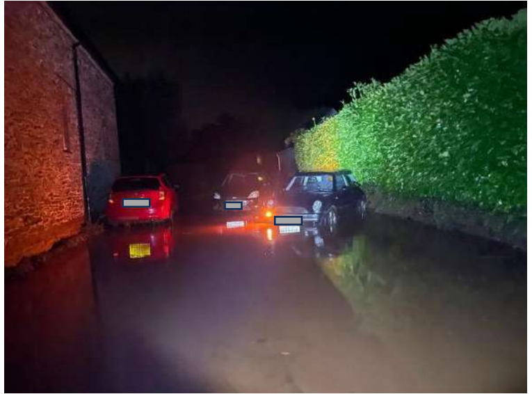
Vicarage Ball. Sunday 3.21am, before the Fire Brigade arrived