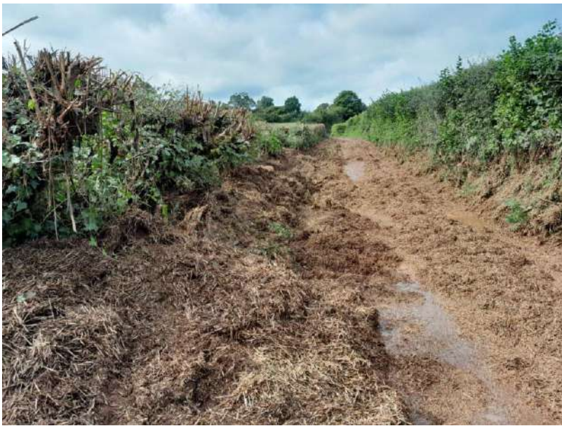
Looking west along Screw Lane, standing on top of hedge bank, straw/mud up to top of hedge bank, road surface not visible, covered in debris deeper than wellies