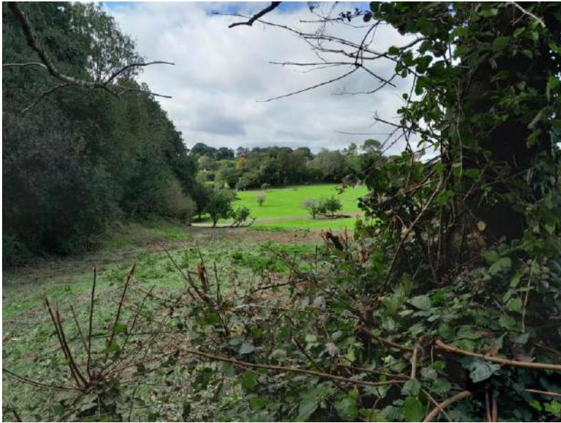
View from hedge bank into Tristford Farm Orchard, showing wide sweep of grass flattened by water overtopping bank along a considerable distance