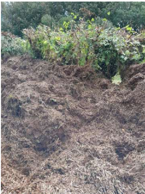
Buddle Hole East 10" twinwall pipe is buried beneath this; runoff has flowed through hedge over hedge bank