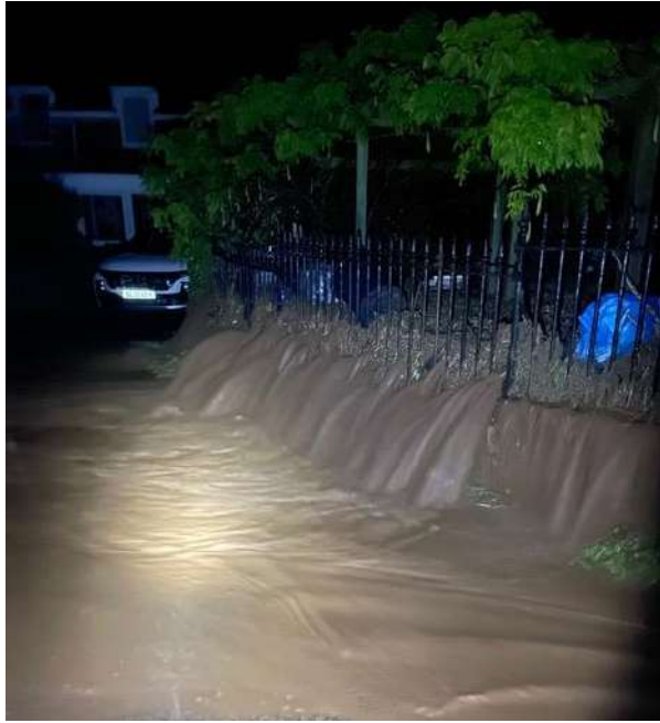
St Clement's wall 3.06am Sunday