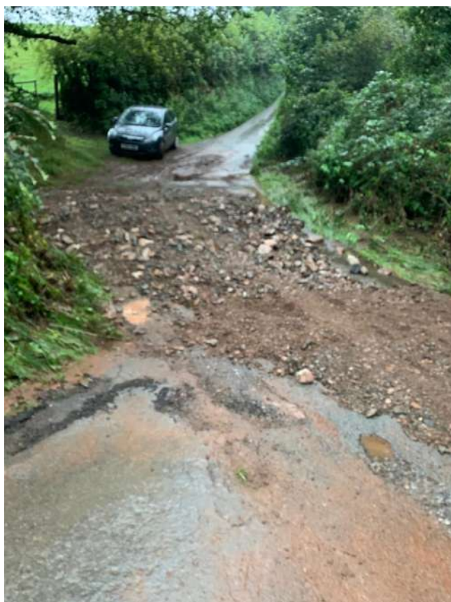
Blocked road into Belsford