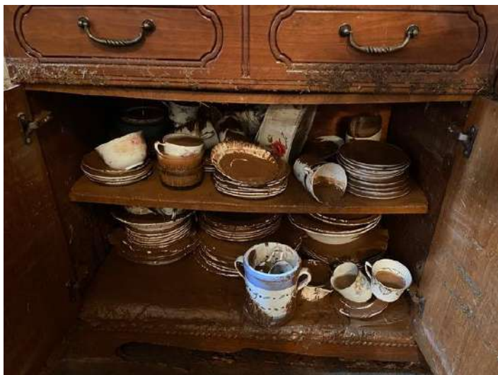
St Andrew's Cottages kitchen. 3.44am Sunday, already going down from the surge at 2.45